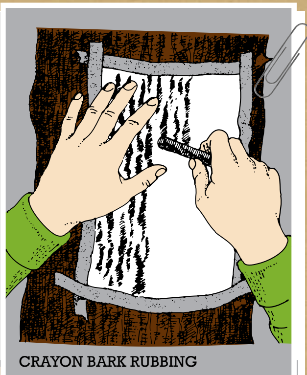
CRAYON BARK RUBBING